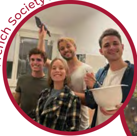
French Society @Mila Wölfer