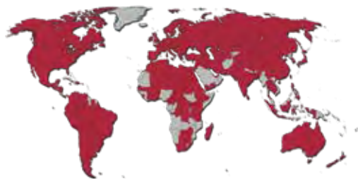
Alumni all over the world (as of 2023)

More than 2,700 alumni from over 130 countries spanning all continents call the DA their alma mater.