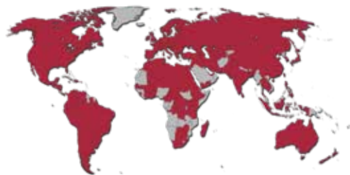
Alumni all over the world (as of 2024)

Almost 3,000 alumni from more than 130 countries spanning all continents call the DA their alma mater.