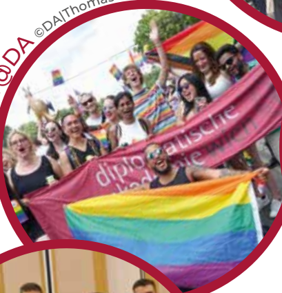
Queer@DA @DAThomas Row