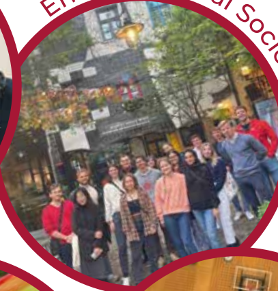
Environmental Society